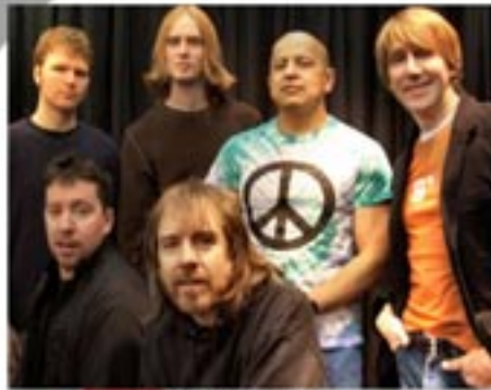
CEILI RAIN celtic/rock www.sonicbids.com/ceilirain